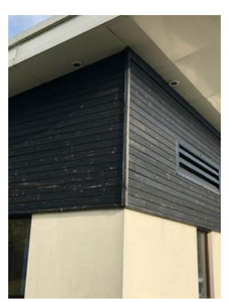
Parts of the cladding around the church building is falling down. Quotation of cost to replace wooden cladding with UPVC (plastic) £4,500

The cladding around the hall has not been treated for 10 years and if this was done by volunteers it would only cost the price of the material needed.